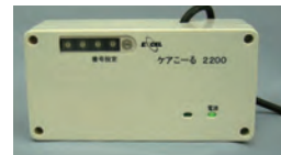
NC-2200 Controller NC-2200CT