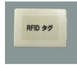
RFID Tag NC-2200TGS 43 × 32 × 11mm