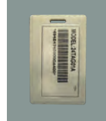
RFID Tag NC-2200TGL 85 × 55 × 3mm