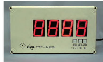
NC-2200 Receiver NC-2200RX

NC-2200 controller detects the RFID tag. This system enables caregivers to identify and locate the resident inside the building. Signals travel through the power line to inform the resident's location to staff station.