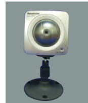
Network Camera BB-HCM100 Panasonic

*Price varies depending on each device cost and terminal installation fee which is necessary by the structure of the building. Please consult with us and we will give you the quote.